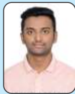
N.Pragnan IIT - KHARAGPUR